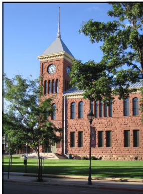
Historic Coconino County Courthouse

Lawyers in our Civil Division advise and represent in litigation the Board of Supervisors, Planning and Zoning Commission, all elected and appointed officials of the county and various special districts. Their practice thus spans a broad spectrum of areas: from elections law to environmental law; from tort defense to zoning enforcement.