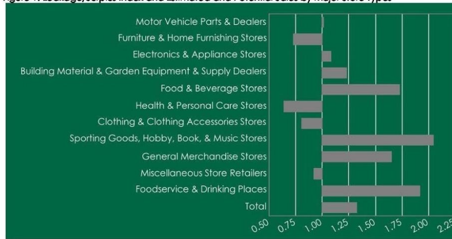
Figure 1. Leakage/Surplus Index and Estimated and Potential Sales by Major Store Types

Figure 1 provides the leakage/surplus indices and following is the sales potential and estimated sales for major store types.