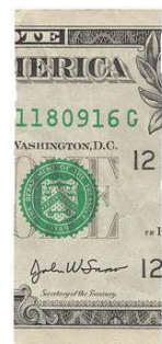
Special Districts 22%