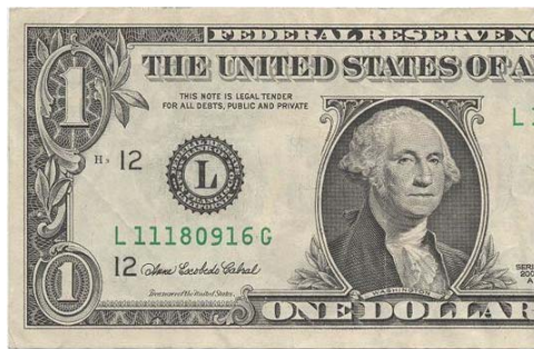
Education - 62%